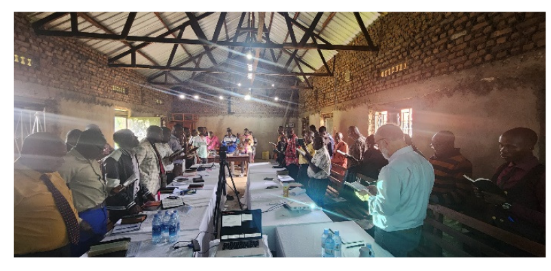
Conference in Mpondwe, West Uganda

In Mukono there were brethren from central, and eastern Uganda representing ten local assemblies from as far south as Sigulu Island in Lake Victoria, and as far north as Sironko.