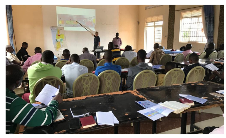
Conference in Mukono, Central Uganda