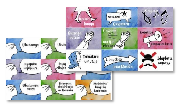
The simulator teaching tool used