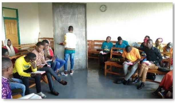
Youth meeting in Kamembe