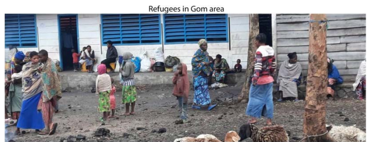
Refugees in Gom area