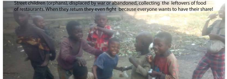
Street children (orphans), displaced by war or abandoned, collecting the leftovers of food of restaurants. When they return they even fight because everyone wants to have their share!