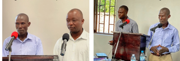
Increasing number of young brothers