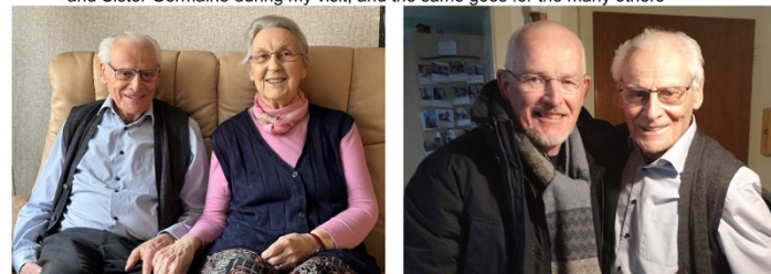
I met in Yverdon and the surrounding area