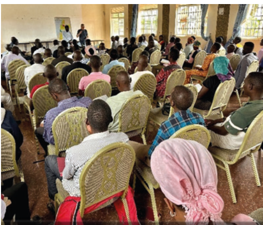
Local brethren sharing in the teaching