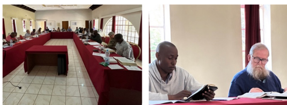
The participants at the Southern African conference

many cities and provinces, beginning in Antioch with : "The Holy Spirit said, Now separate Me Barnabas and Saul for the work to which I have called them. Then they fasted and prayed, laid their hands on them and let them go." (Acts 13:1-3).