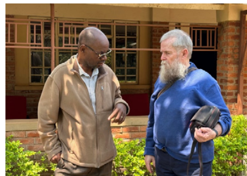
Lively exchanges of experiences during the breaks