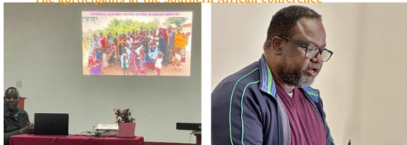
Presentation of the work in Kenya