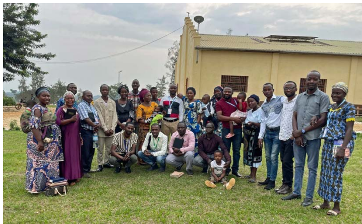
Team of teachers and group leaders