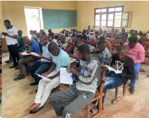
Daily Bible studies