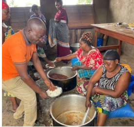
Sisters serving meals

Sisters in Mputu generously prepared and served all meals, contributing to the warm fellowship and hospitality experienced throughout the camp.