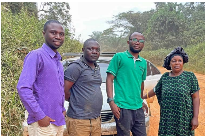
Team from West Uganda traveling to Mputu