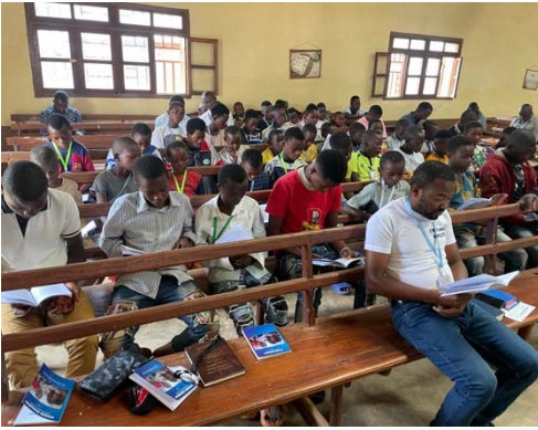
Daily Bible studies