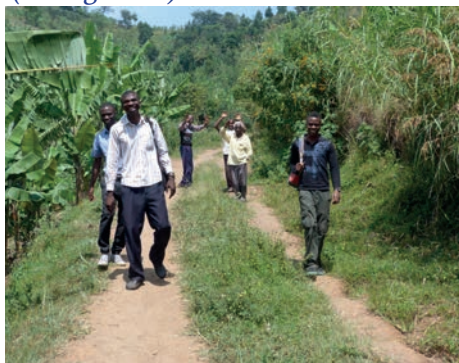
Saying goodbye in Mahango