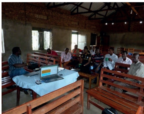
Accountancy meeting starts with breakfast