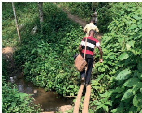
Travelling on the narrow path... (Busingo area)

On the Friday we paid a visit to believers in Mairukumi, where we made two stops.