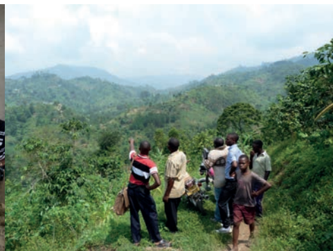
The mountains of Uganda