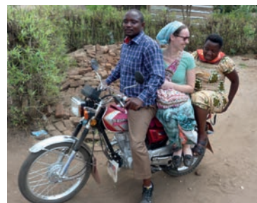
Travelling to Rhewingo