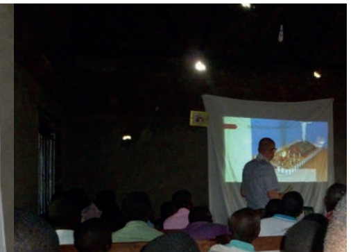
Lessons on the tabernacle.