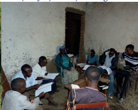
Meeting in the home in Mairukumi