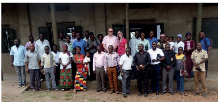
Five nation group photo