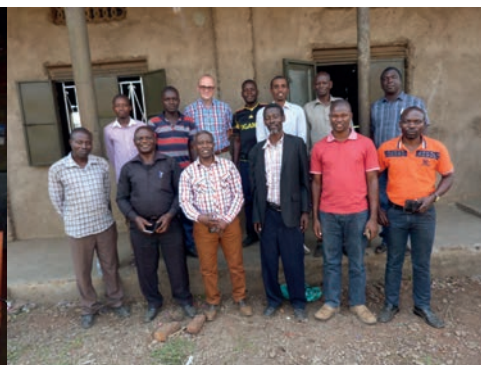
The accountancy group photo