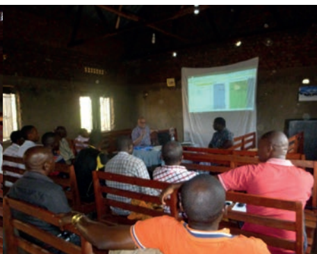
Explaining the new cash book