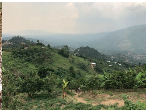
The mountains of Uganda