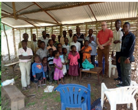
The saints in Mahango in their newly built (not yet finished) meeting hall.