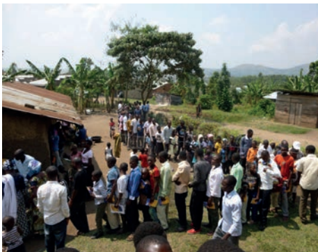
Queuing up for lunch