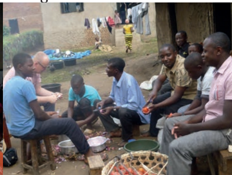
The brothers prepared the meals during the girls'/young sisters' camp.

Also during this camp new hymns were taught.