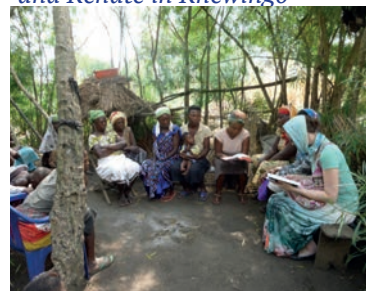
Open air meeting in Rhewingo