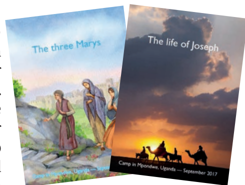
The camp booklets

For both camps we had made booklets (as before) with the passages we were to study and questions for each successive story, and also space for jotting down notes and questions. These booklets have proven to be very helpful for the young people over the past years and they keep them to re-read what they have studied and learned before. The two booklets on Joseph are now being translated into Swahili and Kinyarwanda, so they can be used for camps in Congo (DRC) and Rwanda by the end of the year.