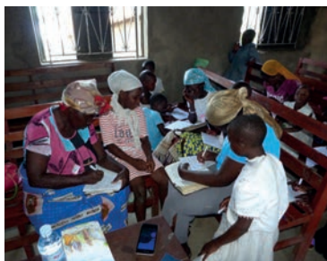
Answering the questions from the booklet.

Renate also continued with the sewing lessons. In January the participants had done some embroidery work and Renate had noticed many had never handled needle and thread before. That is why she decided to make felt purses with them this time. For this a lot of preparations had to be done, as all the pieces of felt had to be cut beforehand, as we could not bring dozens of scissors to Uganda and it would have taken up a lot of time for the young girls and sisters anyway. During the Castlewellan Conference in Northern Ireland (a few weeks before our trip to Uganda) many of the young people there helped with these preparations, for which we were very thankful. The girls and young sisters really liked to sewing work and some of them even made two purses!