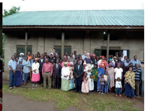
Conference group photo (some had already left). Notice all the blankets!