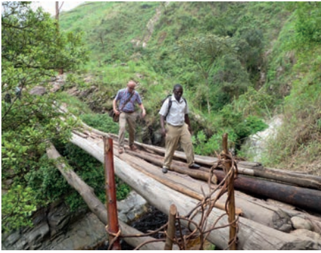
The bridge near Busingo.