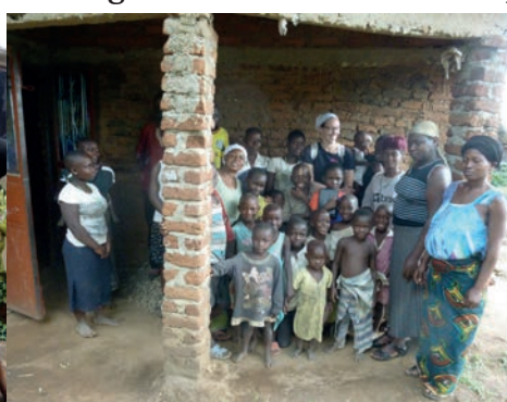
Group photo after a home visit.