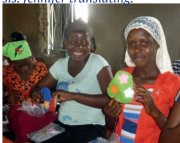
The sewing project.