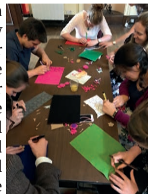
Preparations during the Castlewellan Conference

Renate also continued with the sewing lessons. In January the participants had done some embroidery work and Renate had noticed many had never handled needle and thread before. That is why she decided to make felt purses with them this time. For this a lot of preparations had to be done, as all the pieces of felt had to be cut beforehand, as we could not bring dozens of scissors to Uganda and it would have taken up a lot of time for the young girls and sisters anyway. During the Castlewellan Conference in Northern Ireland (a few weeks before our trip to Uganda) many of the young people there helped with these preparations, for which we were very thankful. The girls and young sisters really liked to sewing work and some of them even made two purses!