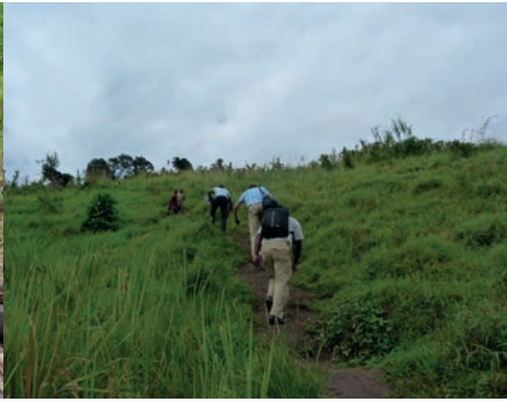
Climbing the mountain.