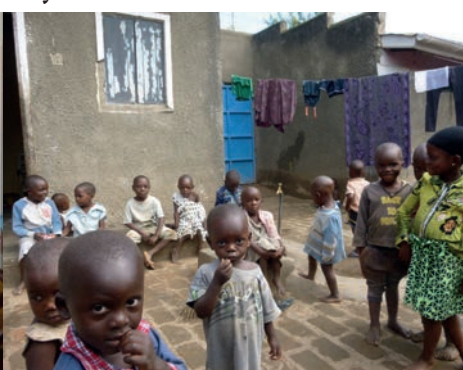
Many children in the Bible Centre.