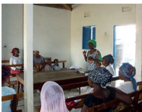
Meeting in the Bible Centre in Kasese.