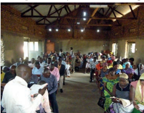
The first day of the conference.