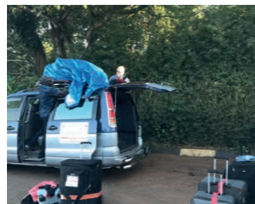
Packing the minibus for the journey to Mpondwe.

Many of the attendees were from the meetings in the area, but others came from various groups, the local brethren are in contact with. Many of them are believers and with some we could really notice the insight in divine things, whereas others are not saved yet. That is why during the camp the gospel also was preached daily. Please pray for those who have heard the gospel, but not yet