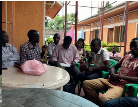
The meeting in the hotel.