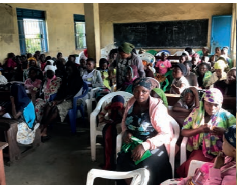
Just before the start of one of the sessions.