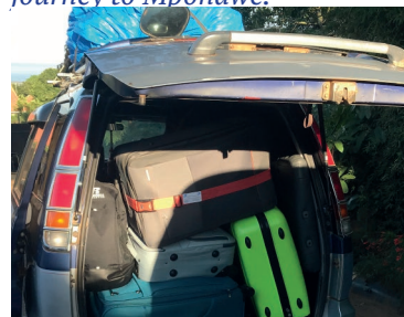
The many suitcases, also containing literature and crafts.