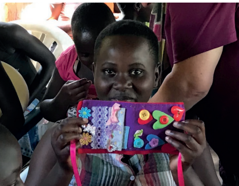
A finished needle book!