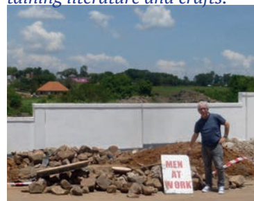
On the road to Mpondwe.