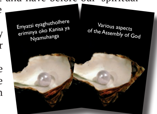
Various aspects of the Assembly of God — in Lhukonzo and English