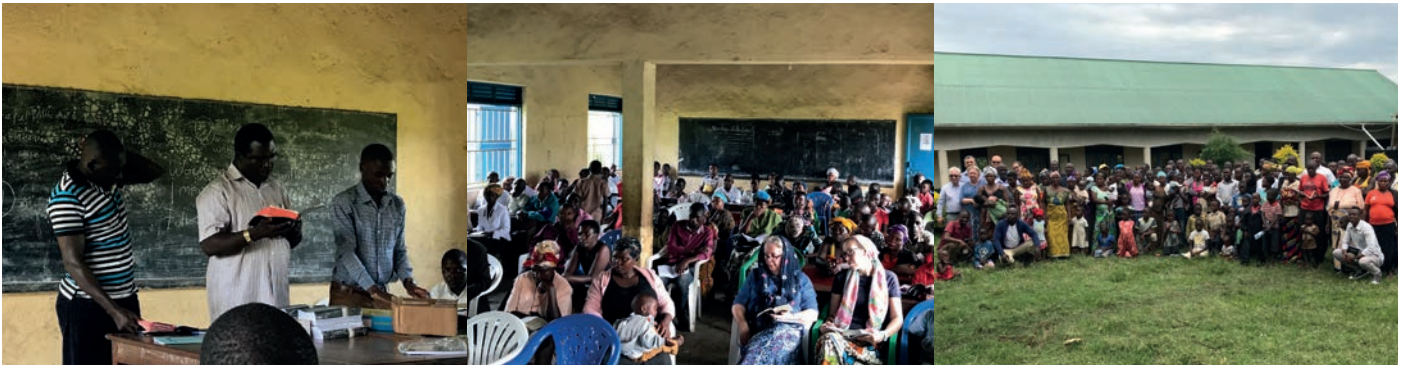
Double translation; Luganda-Lhukonzo-English